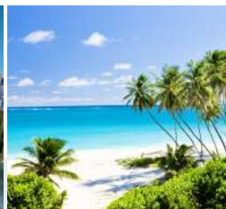
CARIBBEAN, BERMUDA & MEXICO