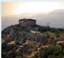
EUROPE & NORTH AFRICA