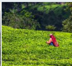
INDIA, SRI LANKA & BHUTAN